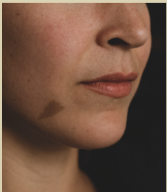
Sense 70 x 60